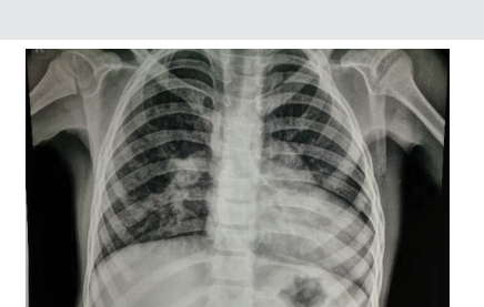
Figure 1: Preoperative Chest Roentgenogram showing features of CPD.

A congenital pericardial defect is a rare clinical condition, involving the left (86%) more than the right [1-3]. Males are more commonly affected than females (3:1). In most of the